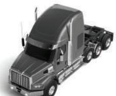
60" Mid Roof